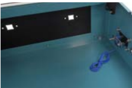
negligible interior fittings and interfaces