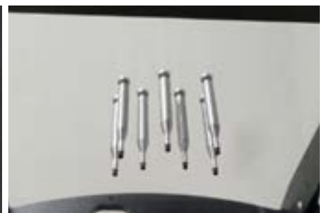
few hold-down devices